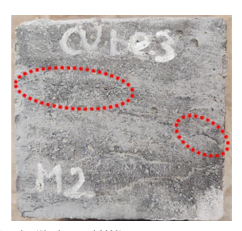
Figure 17. Self-Healing Concrete Samples (Shaaban et. al 2023)