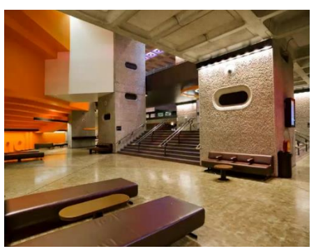
Figure 15. Barbican Centre Interiors (Harwood 2023)