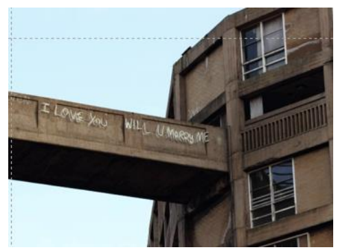
Figure 13. Park Hill Estate, Sheffield – Roads in the sky (Moustaka 2023)