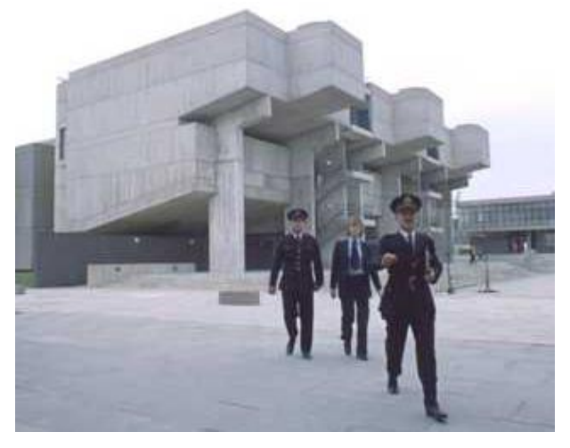
Figure 11. Ludovico Medical Clinic, A Clockwork Orange. Building in the background is the 'Brutalist' Lecture Theatre at Brunel University designed in 1966 by John Heywood. Now Grade II listed (MovieLocations.com, 2023, Historic England 2023)

In the 1980's and 90's this negative association extended to public buildings, such as the South Bank Centre and later the Barbican , even though those operated in a different social and cultural context. ( Figure 12 ) Fairfaced, textured, bush-hammered concrete had acquired a 'bad name' that took around three decades to shed. Even nowadays, when the public is asked about their opinion on concrete 'Brutalist' buildings the reaction is very mixed but more often negative, using words such as 'Depressing', 'Hideous', 'Monstrosity', 'Eyesore' (Harwood 2023) ( Figure 13 )