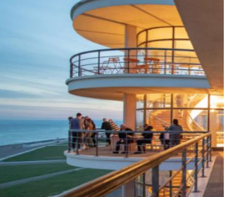
Figure 5. De la Warr Pavilion by Mendelsohn and Chermayeff 1935 (Sussex Modern 2023)