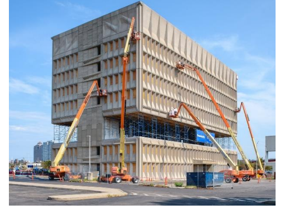
Figure 18. Pirelli Tire Building original form (Forre n.d.)