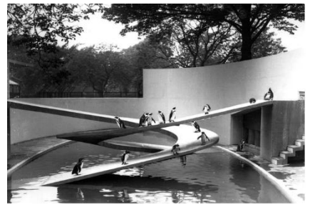
Figure 6. Penguin pool, London by Lubetkin / Tecton 1934 (Victoria and Albert Museum 2023)