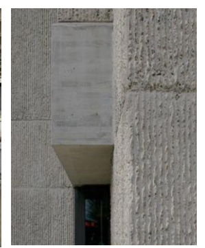
Figure 7, (8, 9) Royal National Theatre (1969-76) Sir Denys Lasdun Listed Grade II* (Harwood 2023)