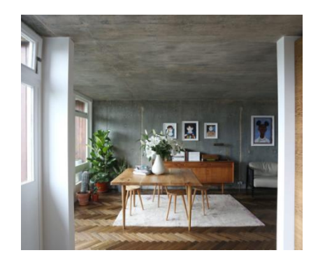
Figure 14. Trellick Tower, Kensington Erno Goldfinger (1968-73) Grade II* Listed (Harwood 2023)

In recent years, there has been a renewed interest in concrete as a building material. Contemporary architects such as Tadao Ando, Frank Gehry, Zaha Hadid, and Daniel Liebeskind have used the structural potential of concrete to create unique, and highly expressive forms and spaces. Concrete is also increasingly used in interior design to provide a minimal and industrial aesthetic in the form of polished concrete floors, countertops, and walls or exposed ceilings. (Figure 14)