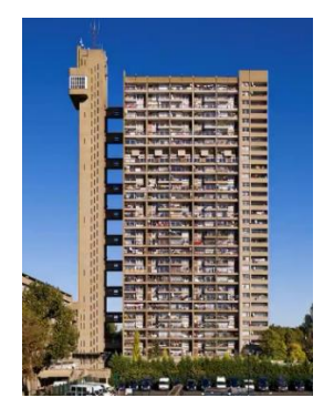
Figure 16. Trellick Tower, Kensington Erno Goldfinger (1968-73) (Harwood 2023)