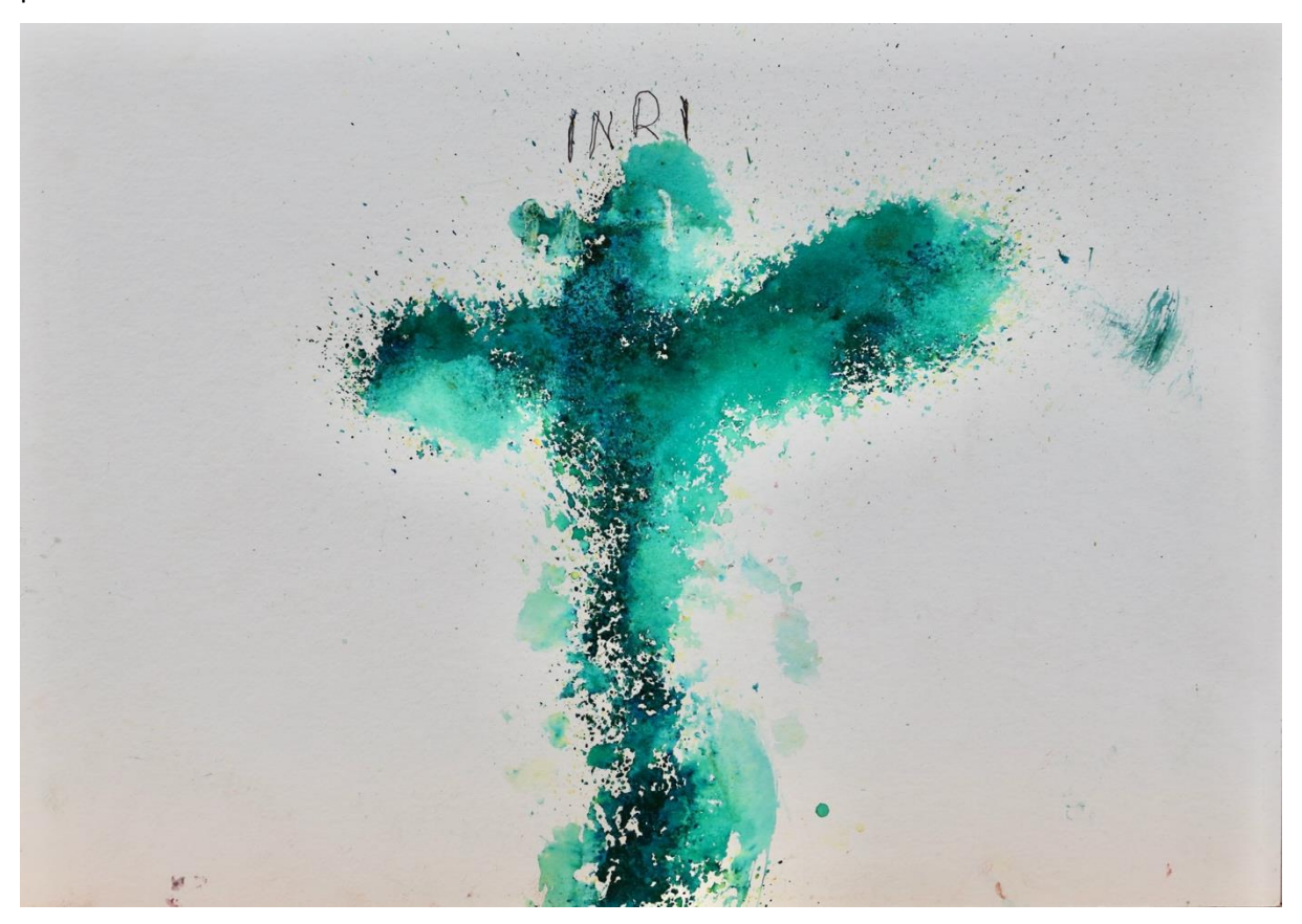
Figure 4 Nancy's painting of the Bible (figure courtesy of Nancy (pseudonym) reproduced with permission