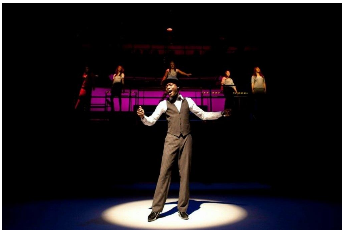
Final Production of WORKING , 2011 - our first graduating year.