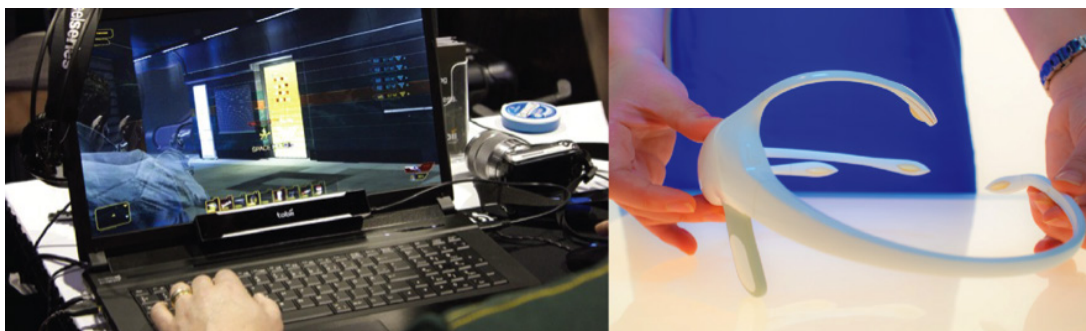
Figure 2: Tobii's EyeX eye tracking device and Emotiv's Insight brain interface.

In this PUI approach very recent input devices can be seen in figure 2, such as brain computer interfaces Emotiv 6 , the Insight, and eye tracking interfaces Tobii 7 , the EyeX, devices are accessible and ready to integrate future development of personal computational device's operating systems for a still more engaging technology mediated interaction experience.