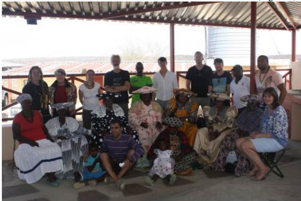
Figure 1: End of the workshop in Okomakuara.

Eight local females in Okomakuara worked with two facilitators: Professor Brereton from QTU and our European colleague G. Cabrero. Sessions were filmed and audio recorded for further analysis, while five local researchers facilitated the sessions and six other researchers stood as observers (Figure 1).