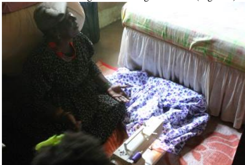
Fig 4: Inside the homestead: showing a dress sewn with a Singer machine.

Despite all, the female participant invited us to return to Otjinene once she had finished a dress she was sewing with her Singer machine (Figure 4).