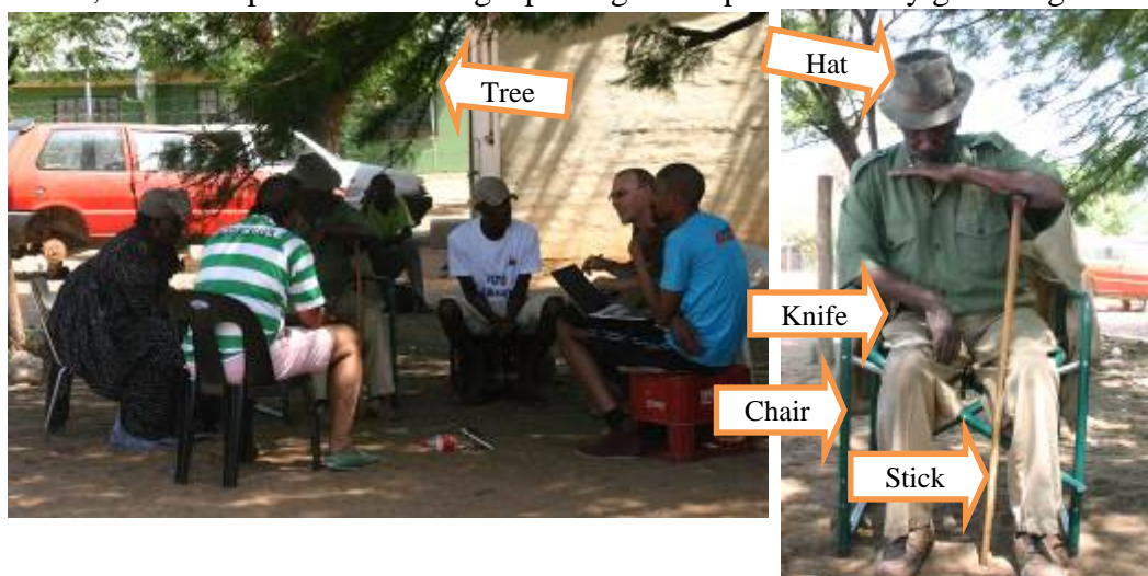
Fig. 2: Wikipedia researchers and elders; Fig. 3: Persona-like elder portrait.

On the first day, Wikipedians run a three-hour focus-group. Questions revealed data on distribution and arrangement of the household, and that this belongs to the wife's realm, whereas external labour belongs to the male chores. Objects symbolizing the male elder's status also emerged in the way of (1)the chair he sits-on, (2)the hat he wears, and (3)the knife and (4)stick he carries with him at all times (Figure 3). The significance of the tree outside the Homestead also came from the discussion, due to the protection it provides; its provision of constant shade, and its importance in being a placing for important family gatherings.