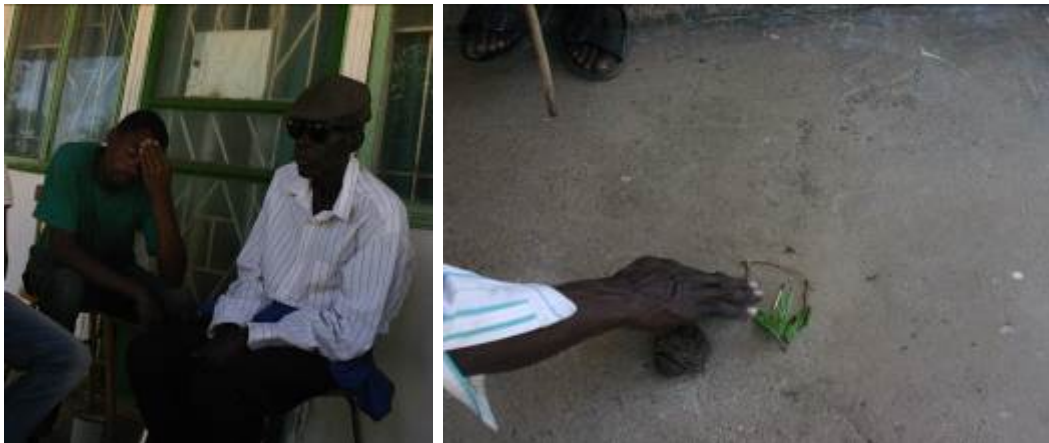
Fig. 5 & 6: Tired participants & 'Persona-Homestead': the holy-fire & a poo.

Three hours over-talking eventually worn out participants (Figure 5), while no much relevant persona data emerged (Figure 6).