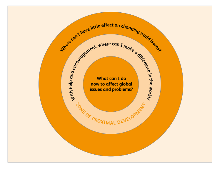
FIGURE 1 Academic Practice for Global Ctizenship: Zone of Proximal Development

Global issues today certainly involve oppression. Let's consider, for example, terrorist acts. They leave communities feeling fearful even as people go about their everyday lives, sitting in coffee shops and attending concerts. Similarly, we identify with the human despair of the enormous refugee migration across Europe. In much the same fashion, students understand how such global issues affect their identities. Academic practices that engage in this kind of reflection can encourage student discussions about how these issues make them feel; and how these issues impact students, and their families and friends. This dialogue can bring to light the struggle experienced by students who confront these issues. It constitutes an act of humanity as opposed to the inhumanity that lies, as Freire tells us, at the heart of the oppressor's violence. This conversation can unearth students' relationships with the world, their perception of these issues, and bring these themes down to the level of personal impact. Student self-awareness will then become a catalyst