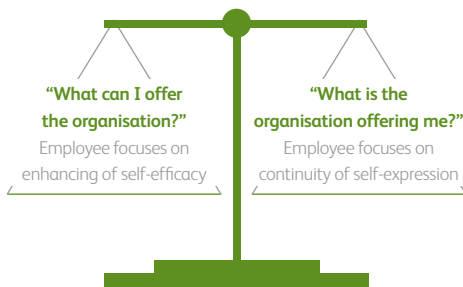
FIGURE 1: The balance of the exchange within the first year of employment

insider information and formulated a more realistic picture about the organisation's way of functioning, individuals seek a defined career plan which can fulfil their aspirations set prior to joining and which can take them forward, beyond their present employment. At that point the new recruits questioned whether their present employment fitted well with their personal values or needs, and evaluated whether it was posing a threat to their ideals. A decision was made, consciously or not, about their longevity in their employment. If their new employment relationship was seen to be threatening their personal identity, then individuals would seek rectification, either by altering the present arrangements or through moving on to another organisation. Indeed the subjective point of view on career matters (Millward and Kyriakidou, 2004) and cannot be underestimated or dismissed when examining career decisions.