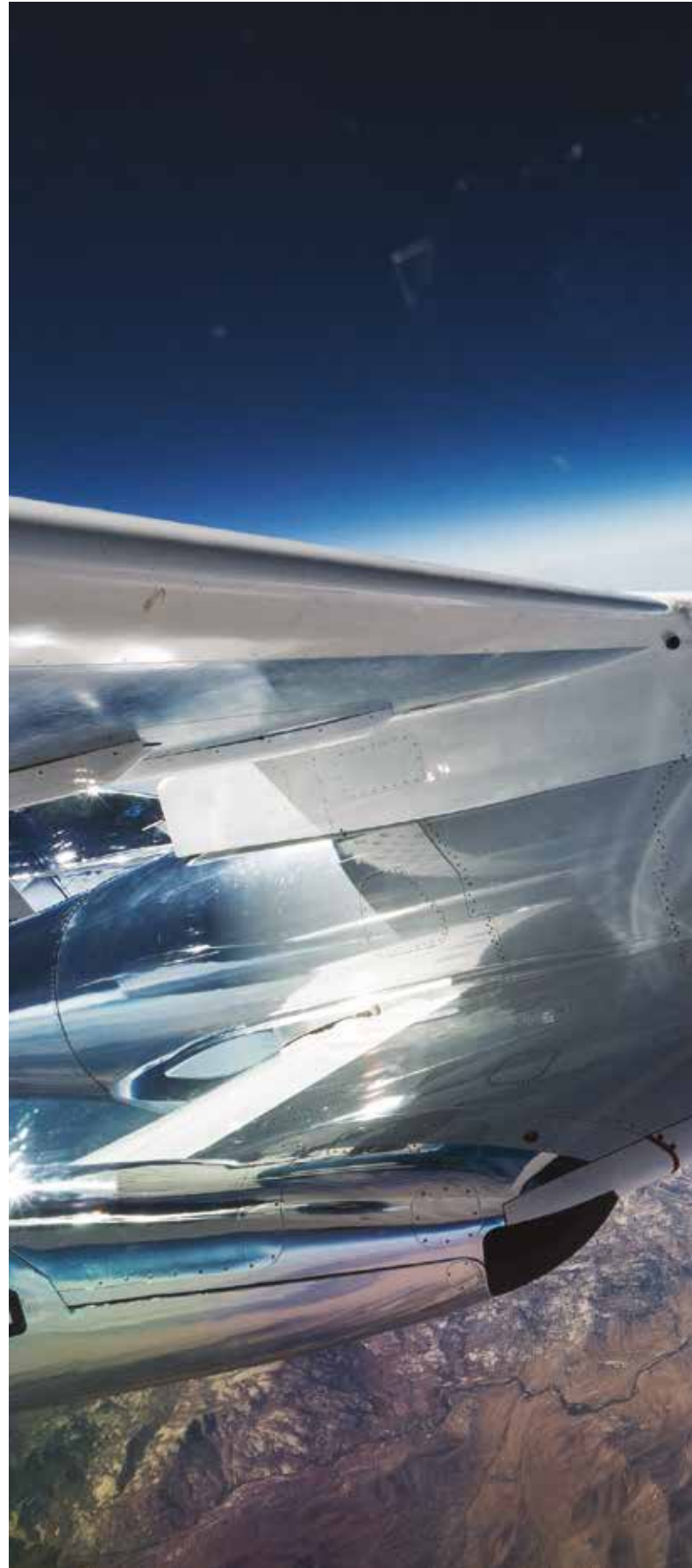
Image: VMS Eve (Virgin Mother Ship) carries VSS Unity (Virgin Spaceship) for its first flight ever over Mojave, CA on Thursday September 8, 2016