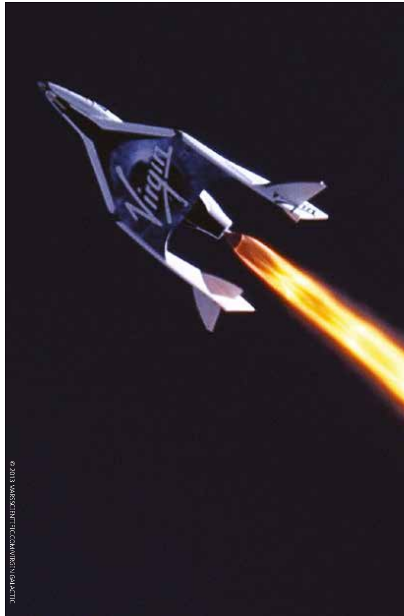
Clockwise from top: Virgin Galactic's first SpaceShipTwo during its first supersonic powered flight SpaceX's Dragon capsule, scheduled to take tourists around the moon in 2018 SpaceX's CRS-10 Drago