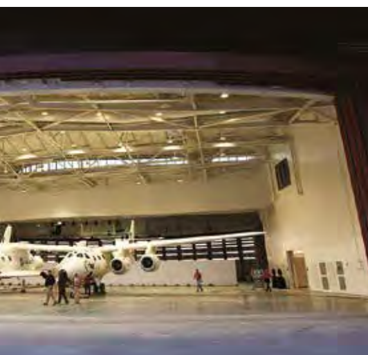
Clockwise from top left: A SpaceX launch UK spaceport locations WhiteKnightTwo carrier aircraft, VMS Eve and SpaceShipTwo in hangar at Spaceport America Virgin Galactic Spaceship Two