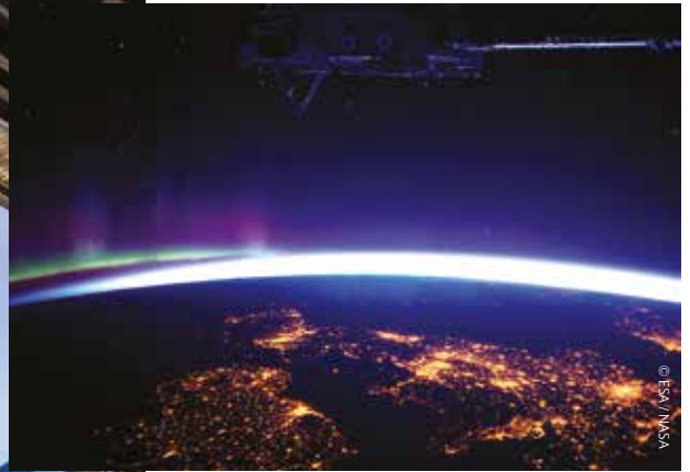
Above: UK from Space