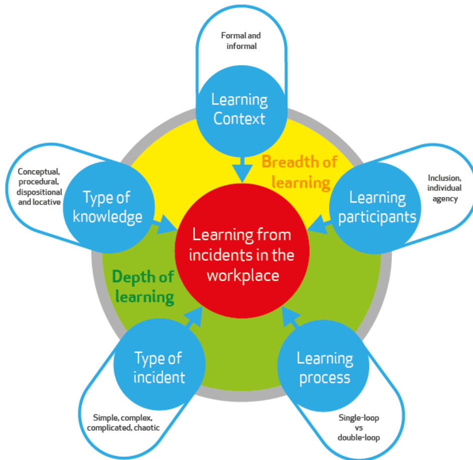
Figure 2. The LFI Framework (diagram adopted from Littlejohn et al, 2017)

Component 3, the Learning from Incidents Questionnaire (LFIQ) is a 46-item diagnostic instrument to help organisations identify employees’ perceptions and experiences of the LFI processes and practices. The LFIQ is structured around the six phases of the LFI Process Model (see Component 1) and the five elements of the LFI Framework (Component 2), thereby operationalising these for use in practice. The LFIQ was validated through a study involving 781 employees from two energy companies (Littlejohn et al, 2017).