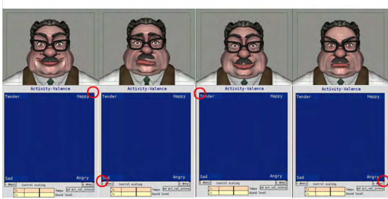
Fig. 5. Relation between character expressions and the point position in the pDM (or pDaniM) interface.

one more way to dialogue about the movie, to preview the final result.