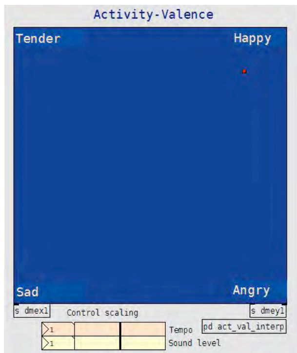
Fig. 3. pDM Activity-Valence graphic interface used to change the emotional expression in real-time performance.

emotions. By the conjugation of these two axes the quadrants of the square can be characterized as happy, sad, tender and angry. Beside this mapping scheme, there are others present in the program like the Kinematics-Energy and the Musical Mapping. These are nothing but different combinations between the rule parameters and the 2D graphic. Other relations can be suggested regarding the target application, the interface and other factors related with its use.