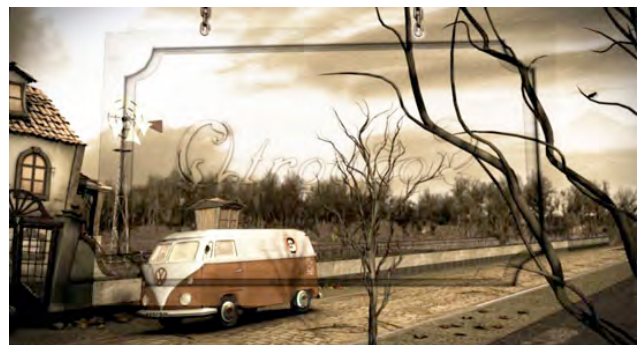
Fig. 1. A frame of “O Trovão” initial scene. A 3D animation movie used as case study on this project.

type of audiovisual project the psychoacoustic experience of the audience is always completely created from scratch. Since all the visuals are usually computer generated, sound (and especially musical sounds) often assumes an added importance in the achievement of the overall expressiveness conveyed in the piece. Furthermore, in order to accomplish a strong sense of realism and expressiveness in the key dramatic points of a narrative it is fundamental to guarantee a coherent correspondence between the animated characters, created by the animation artists, and the music created by the composer. Also, in this matter it is important to overcome issues that somehow consume energy and time to whom is working on them without improving the final result and that is the goal of this research: find ways to overcome time and money issues, in order to produce creative hi-end solutions for sound design in computer animations. To help with this problem, a software application based on an existing one (both described later), was developed by the author.