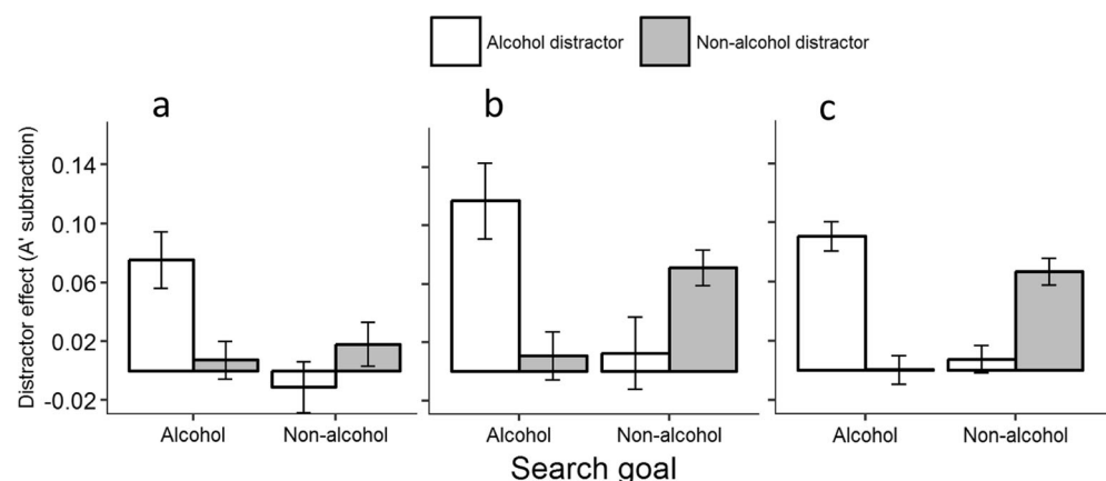
Fig. 2 Graph depicting the mean distractor effects across experiments 1a, 1b, and 1c. The distractor effect reflects the subtraction of the A' detection sensitivity score when the distractor was of the same category as one of the search goals, from the distractor which is never searched for. This distractor effect was calculated for both search goal conditions. Error bars reflect within-participants' standard error

In contrast to the large and consistent goal-driven distractor effect when the alcohol distractor was incongruent with the current search goal, there was a non-significant and negligible effect size, when comparing it to the goal-incongruent non-