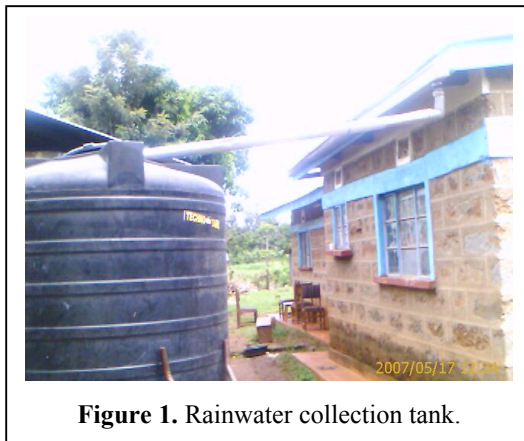
Figure 1. Rainwater collection tank.

Few properties have electricity, but most members have mobile phones which can be charged at the local town or by neighbours with access to electricity. Some villagers have solar panels which supply small amounts of power. The nearest fixed access to the Internet is in the town 20 km away.