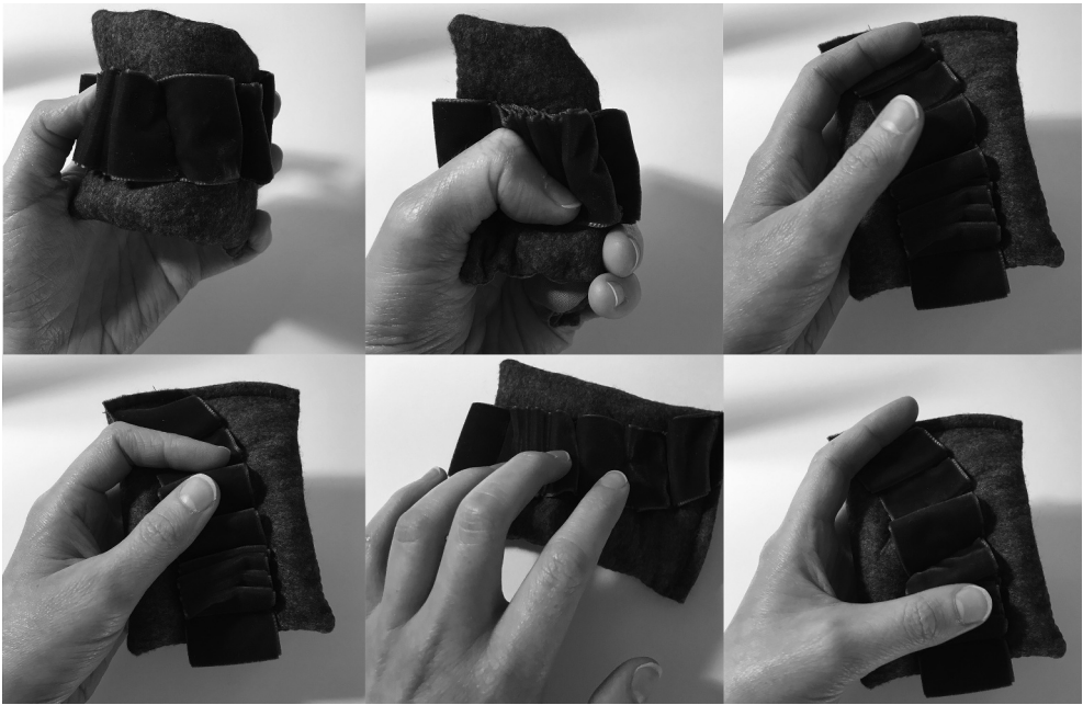
Figure 2. Exploring shared material interactions.