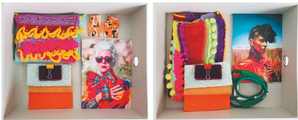
Figure 4. Two of the “playful” session boxes.

There ... P20 (PWD) said, as she stood back, assessing the look of the necklace on my waist. She went on to say: I think it is nicer there than around your neck – it doesn't matter where you wear it, it is the effect. [participant verbatim and researcher notes]